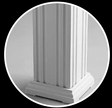
Square Fluted Column