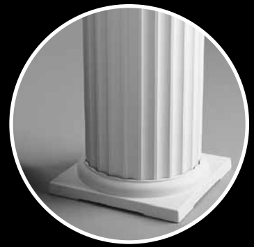
Round Fluted Column

When you choose Monticello® Columns, you're choosing luxury that lasts.